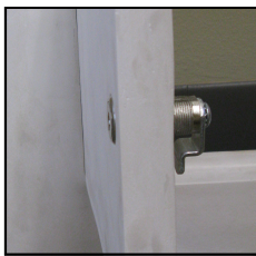
Flush Cam Lock