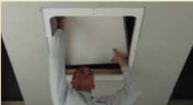
3. Install drywall and place access panel in opening.