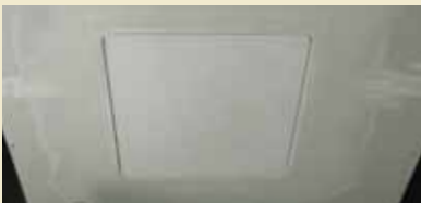
5. Apply desired finish.