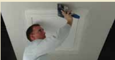
4. Tape and apply drywall compound.