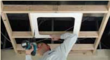
2. Mount Stealth surround with drywall screws.