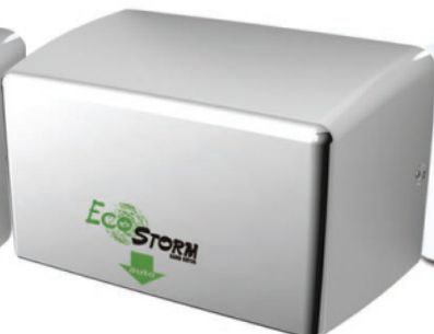
HD0940-10 Bright Stainless