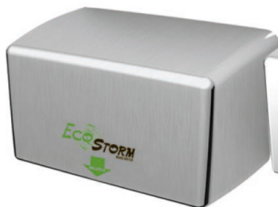
HD0940-09 Brushed Stainless

THE ECOSTORM HUSH IS ONE OF THE QUIETEST HIGH SPEED HAND DRYERS IN THE INDUSTRY!