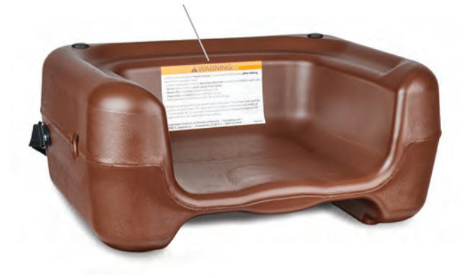
A visible safety warning label

Ability to be attached to an adult chair