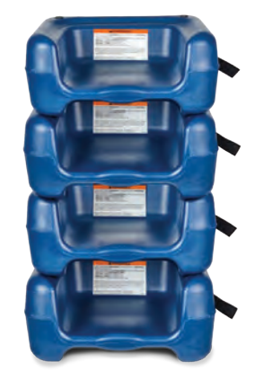
The Restaurant Booster stacks neatly for easy storage.