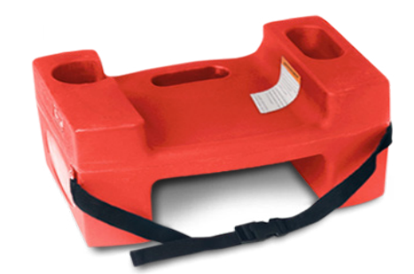
Booster Buddy KB116-03

Keep your Koala Kare products in good working order for the families who visit your establishment. By performing regular maintenance and purchasing replacement parts when needed, your products will safely meet your establishment's needs for many years to come. Use the checklists below to examine your booster seats and make sure they are safe and sanitary.