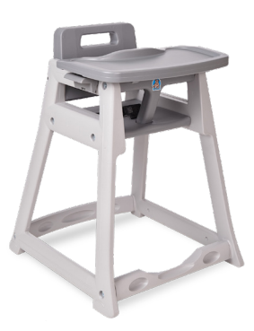
Diner High Chair KB950-01