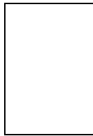
*White (W) (Standard on Most Cabinets)