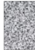
*Gray Hammerstone (GH) (N/A for RC, RBC, SM, Canopy Cabinets)