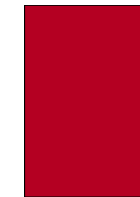
Red Hammerstone (RH) (N/A for RC, RBC, SM, Canopy Cabinets)

All Colors Shown are Available on Painted Products at an Additional Charge.