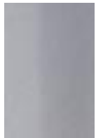
*Silver (SI) (N/A for RC, RBC, SM, Canopy Cabinets)