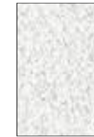
White Hammerstone (WH) (N/A for RC, RBC, SM, Canopy Cabinets)