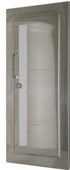
#8 Near Mirror Finish Note Reflected Image of Objects

#4 Finish: Type 304 Stainless—standard on our products. Characterized by short, parallel polishing lines. This is the most common finish. Also described as a number 4 polish.