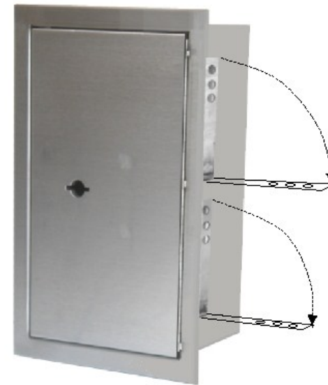
Extend masonry anchors provided, for installation in new masonry construction.