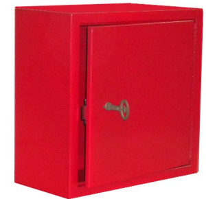
SVC-13 With Optional Color

New—Deeper SFC 11 & 12, SSFC 31 & 32 Cabinet Now Fits 10 lb Cosmic and Galaxy!!