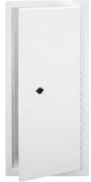
SFC11 with Optional Detention Deadbolt DDI5010 Installed

Fire-Rated: This cabinet is available as fire-rated. See the