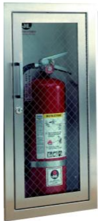
G - Full glass with pull & Saf-T-Lok®