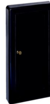
L24 Solid with cylinder key lock & no pull

E.G. L22, W.3 & B10 Door Styles w SAF-T-LOK™