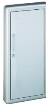
L22 - Solid with pull & Saf-T-Lok®