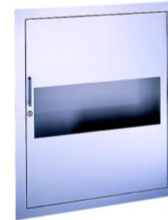
A - Centered Horizontal Panel with Saf-T-Lok®