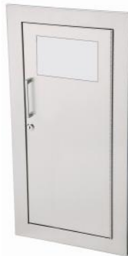
E - Horizontal duo panel with pull and Saf-T-Lok®