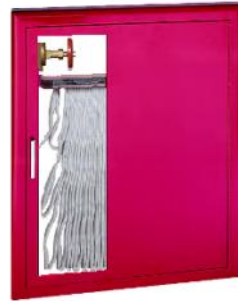
V - Vertical duo panel with pull