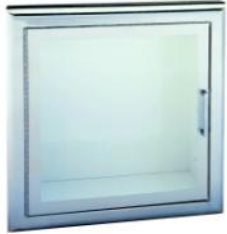
F - Full glass with pull