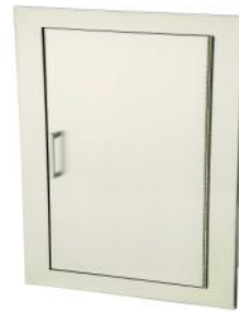
S21 - Solid with pull