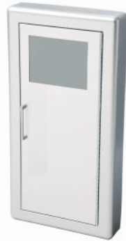
D - Horizontal duo panel with pull