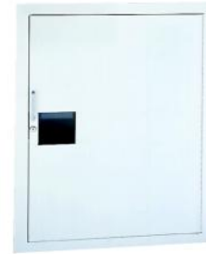
B10 - Solid with pull, view window & Saf-T-Lok®