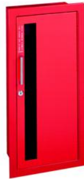
W - Vertical duo panel w/ pull & Saf-T-Lok®