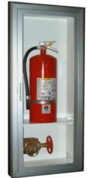
Dual cabinet with shelf - 8000 Series