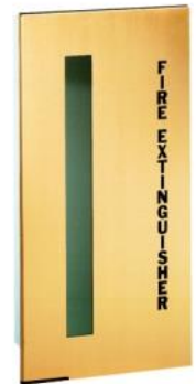
5654V10 Brass With Concealed Pull