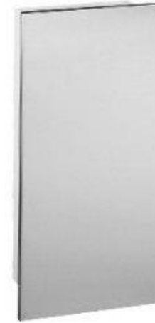
5634S21 Stainless Steel