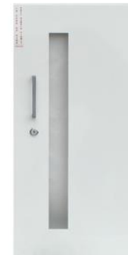
5614W10 Steel with Pull Handle and Saf-T-Lock