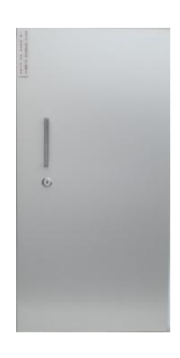
L22 - Solid with pull & Saf-T-Lok®