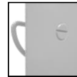
Standard Cam Latch