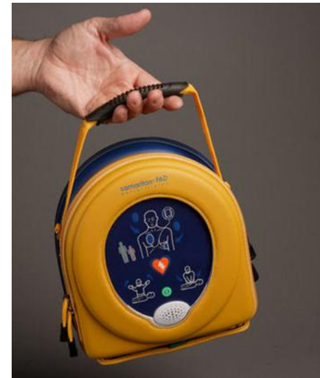
PAD HeartSine AED with Carry Case

* This unit offers significant savings over other defibrillators that require separate battery and pad units. Best of all, once the device is used, a replacement Pad-Pak is quickly installed and ALL your consumables are refreshed and the system restored at once.