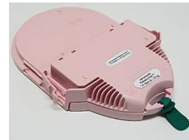
PAD-PAK-02 Pediatric AED