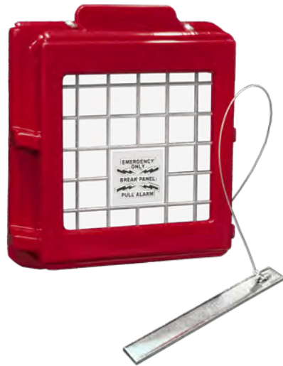
Security Alarm Cover with Break Bar

Cato's quality protective alarm covers, manufactured in the U.S., provides a dent and rust proof alternative to metal. The protective alarm cover with the security cover is vandal resistant and contains a side slot to hold the break bar in place when not in use. It arrives fully assembled and is quick to install.