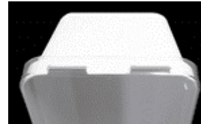
Warrior WC White body Clear cover