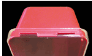
Warrior RC Red body Clear cover