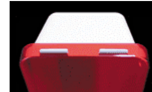
Warrior WR White body Red cover