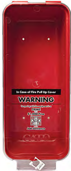
Warrior 95-10 RC

Cato's affordable fire extinguisher series, manufactured in the U.S, provides a dent and rust proof alternative to metal. Cato's Warrior series fire extinguisher cabinet is a two- piece construction with a locking seal. No additional padlock is required. Simply pull up to break the seal and remove the cover to access extinguisher inside.