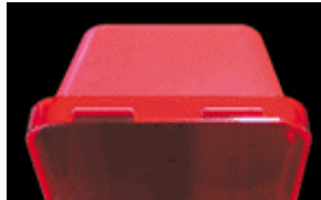
Warrior RR Red body Red cover