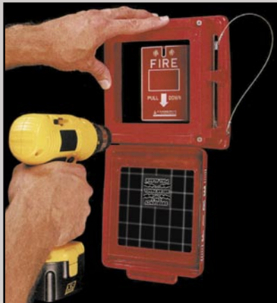
Easy to install in minutes

Protective covers, as manufactured by Cato, with body and hinged cover injection molded of high-density red polyethylene and scored acrylic break panel with UV resistant instruction label. If model with breaker bar is specified, the bar is galvanized steel and is attached to the cover with nylon-coated steel cable. Covers with pull handles are integrally molded of copolymer polypropylene and have a UV resistant "Pull To Open" label. All covers come standard with two UV resistant side labels for easy locating of alarm pull station.