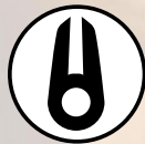
Cross section of gasket

GASKET (X) - The gasket is uniquely extruded with an air pocket, which allows water-tight installation on stucco and other rough, uneven surfaces.