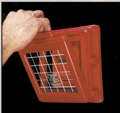
Easy to use

Distributed by www.Ameraproducts.com Phone: (800) 608-6568 Fax: (409) 840-5545 info@ameraproducts.com