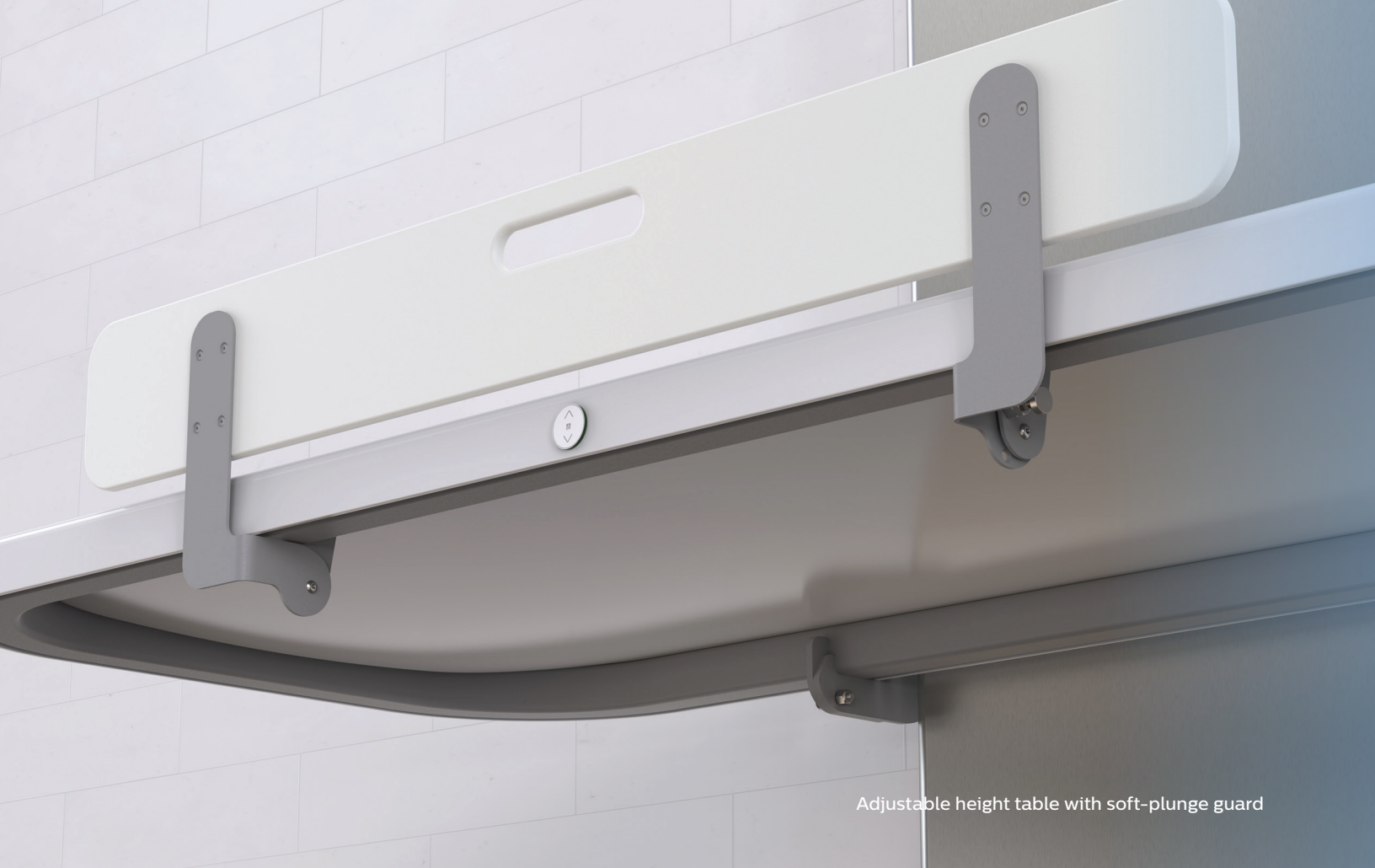
Adjustable height table with soft-plunge guard