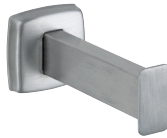
9314 Bradex® Towel Hook, projects 4⅞" 9314-US Domestic