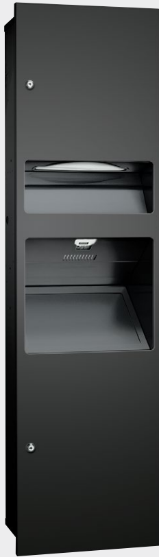
64672-41 RECESSED 3-IN-1 PAPER TOWEL DISPENSER, HIGH-SPEED HAND DRYER AND WASTE RECEPTACLE