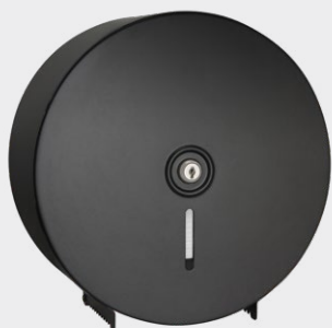
0042-41 SURFACE MOUNTED JUMBO ROLL TOILET TISSUE DISPENSER