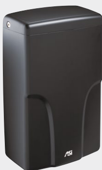
0196-41 TURBO-PRO™ HIGH-SPEED ADA HAND DRYER