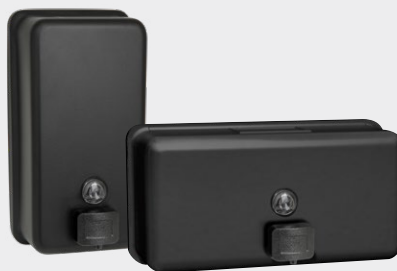
0347-41 VERTICAL SOAP DISPENSER 0345-41 HORIZONTAL SOAP DISPENSER