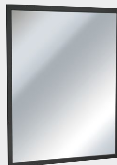
0600-41 ANGLE FRAME MIRROR