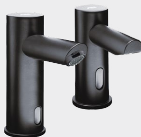
0397-41 EZ FILL™ WATER FAUCET 0394-1AC-41 EZ FILL™ FOAM SOAP DISPENSER