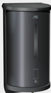
0362-41 AUTOMATIC LIQUID SOAP AND GEL HAND SANITIZER DISPENSER