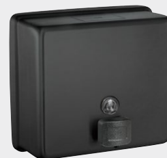
9343-41 SOAP DISPENSER

Distributed by www.Ameraproducts.com Phone: (800) 608-6548 Fax: (409) 840-5541 info@ameraproducts.com