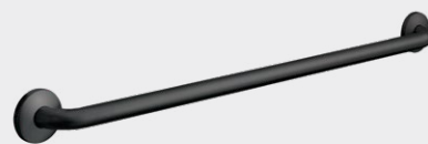
3801-41 STRAIGHT GRAB BAR