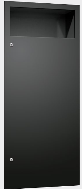
6474-41 RECESSED WASTE RECEPTACLE