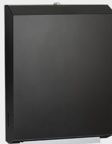
0210-41 SURFACE MOUNTED PAPER TOWEL DISPENSER