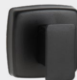
7340-41 SINGLE ROBE HOOK

Distributed by www.Ameraproducts.com Phone: (800) 608-6568 Fax: (409) 840-3545 info@ameraproducts.com