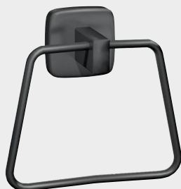
7385-41 TOWEL RING