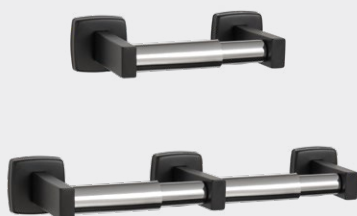
7305-41 SURFACE MOUNTED TOILET TISSUE HOLDER