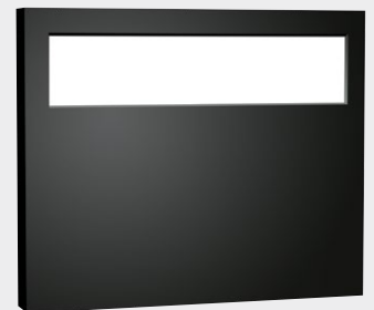
0477-SM-41 SURFACE MOUNTED TOILET SEAT COVER DISPENSER