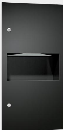
64623-41 RECESSED PAPER TOWEL DISPENSER AND WASTE RECEPTACLE