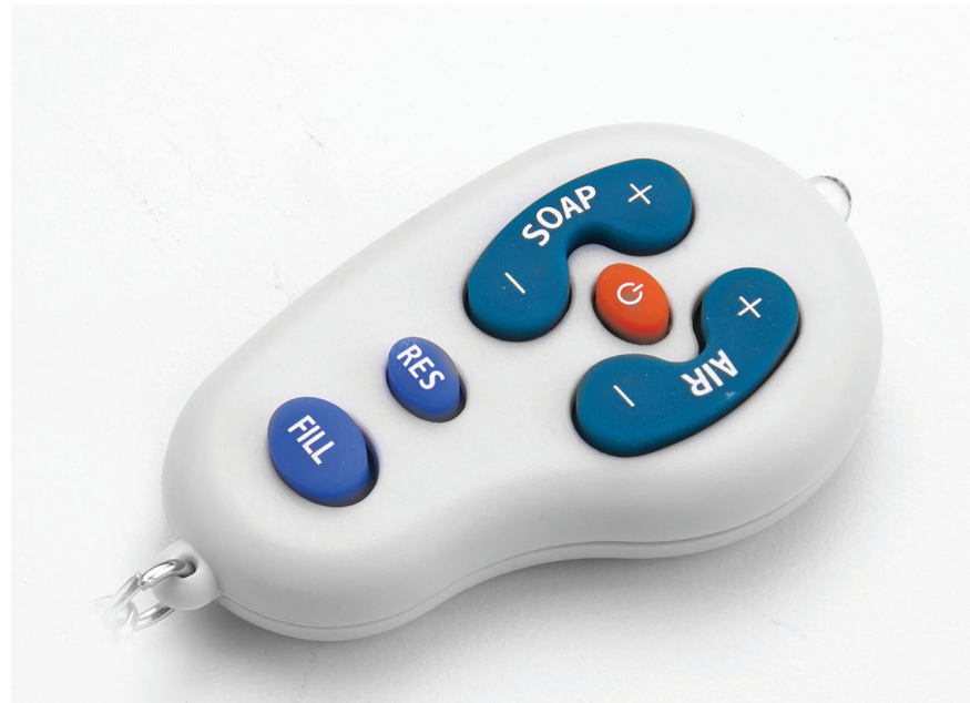
EZFILL™ FOAM REMOTE CONTROL

REMOTE CONTROL FOR ALL MODELS 0393-(n) and 0394-(n) Vanity Mounted Automatic Foam Soap Dispensers