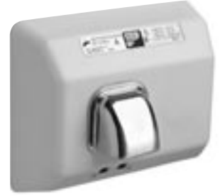
A-TR Series Recess, Automatic

American "A" series push button & automatic hand and hair dryers are constructed with a 1/4 inch thick cast iron cover with a white porcelain enamel finish. Other features include a chrome plated nozzle and push button. The motor, timer and automatic sensor are 100% maintenance free. 10 year limited warranty.