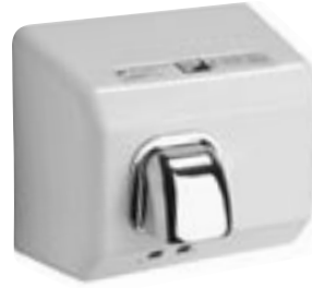
A-T Series Surface, Automatic