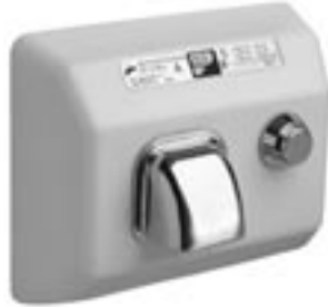
A-R, A-HR Series Recess, Push Button