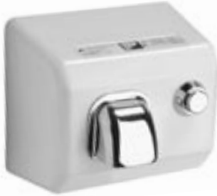
A, A-H Series Surface, Push Button