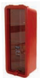
105-10R *Also Available In White

Distributed by www.Ameraproducts.com Phone: (800) 608-6568 Fax: (409) 840-5545 info@ameraproducts.com