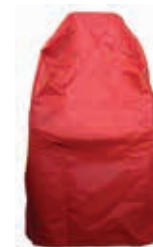
WHEELED UNIT COVERS WFE50, WFE150 & WFE350