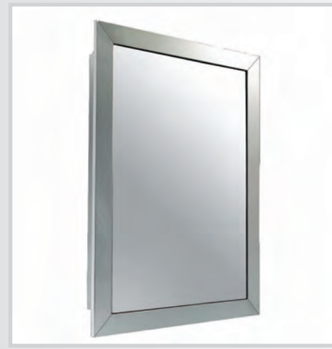
AL227WF - Wide Frame Single Door

Distributed by www.AmeraProducts.com Phone: (800) 608-6548 Fax: (407) 840-3542 info@ameraproducts.com