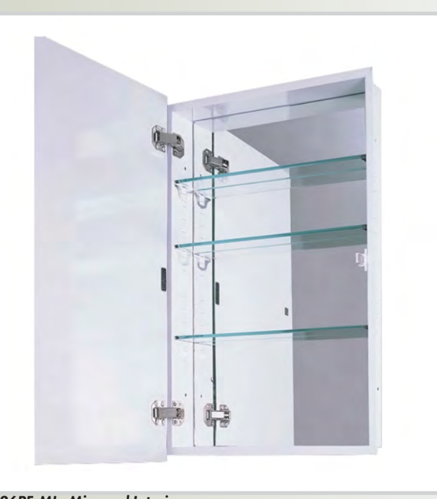
126PE-MI - Mirrored Interior