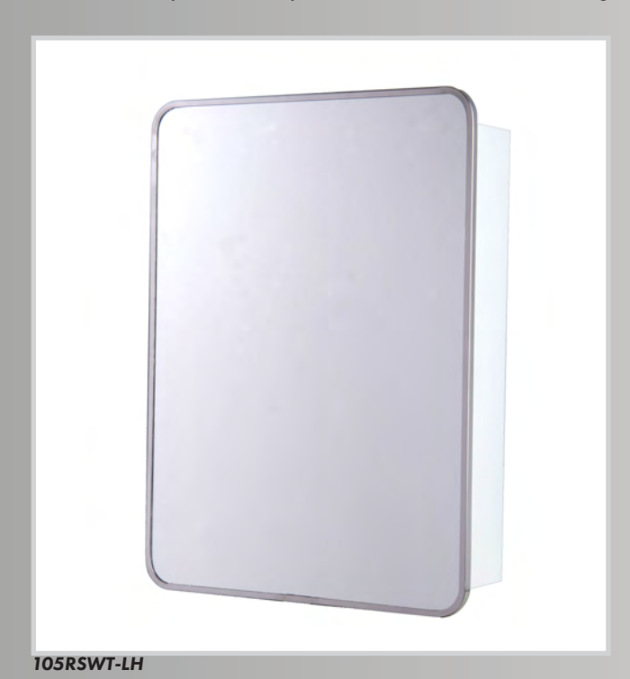
105RSWT-LH - Open

Shelves: Adjustable acrylic shelves mounted on locking adjustable aluminum shelf clips.