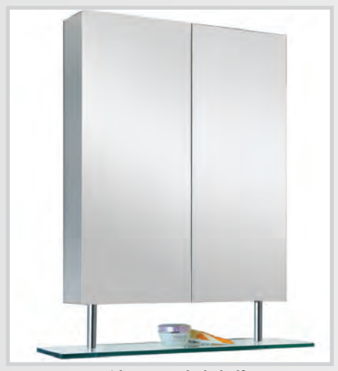
DD-1926-SH with Suspended Shelf

Shelves: Fixed stainless steel shelves. Suspended exterior tempered glass shelf with a polished edge.