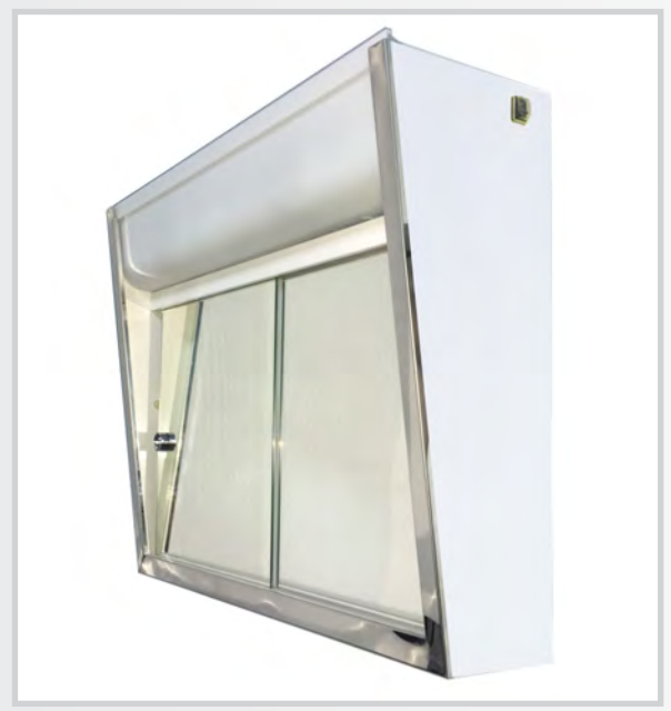
SDL-2419 - Side View