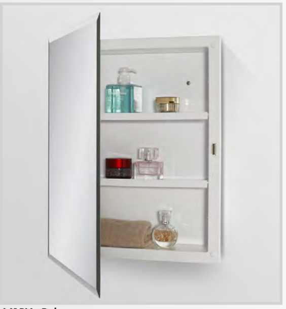
661 BV - Polystyrene