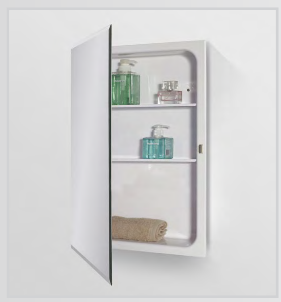
675BV - Deep Drawn