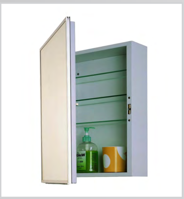
174-HCSM - Open