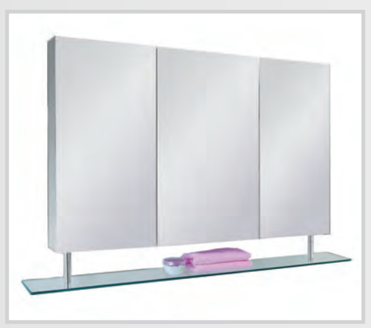
3722-SH with Suspended Shelf