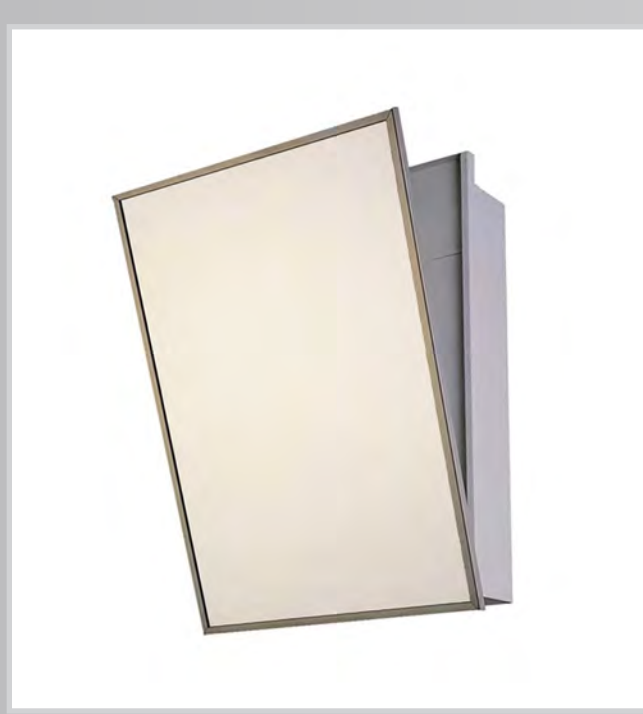
174-HCSM - Mirror Tilted

Mirrors/Doors: 3/16" first quality plate glass framed with bright annealed stainless steel. Doors are mounted on a full length piano hinge and are equipped with a magnetic door catch. Tilt mirror operates on two heavy duty elbow hinges and is secured with two bullet type latches; one to secure the tilted mirror in place and one to hold the door closed. Doors are hinged on the left. Shelves: 1/4" adjustable tempered glass shelves mounted on locking adjustable aluminum shelf clips.