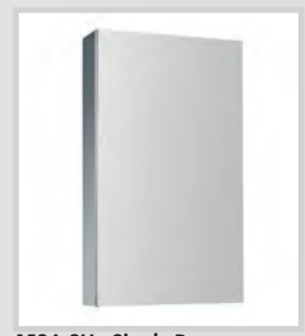
1526-SH - Single Door without Suspended Shelf