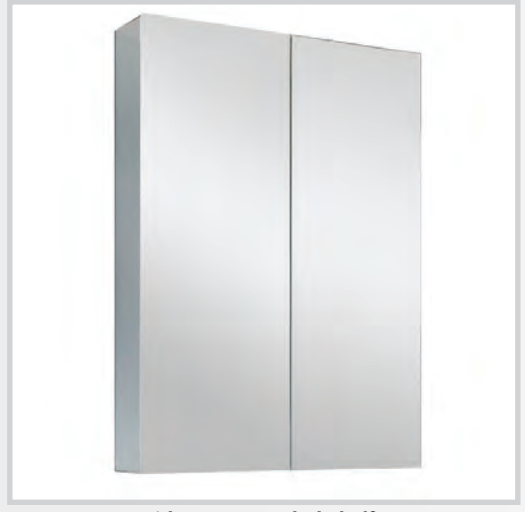
DD-1926-SH without Suspended Shelf