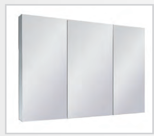
3722-SH without Suspended Shelf