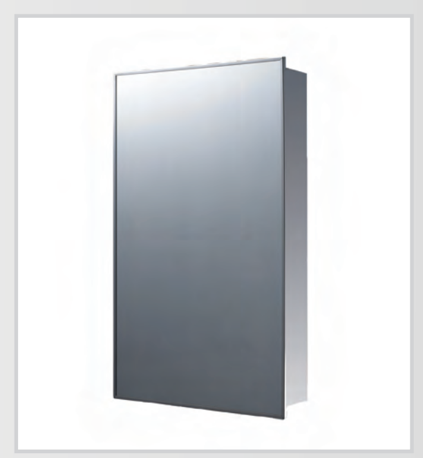
174SS-SM - Single Door

Projection is 1 3/4" for the above models