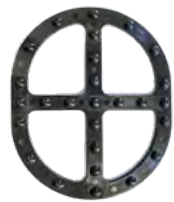
Fire Extinguisher Tray Accessory