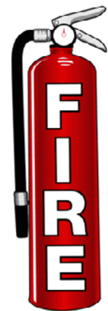
CL-401 Decal available with red or white background