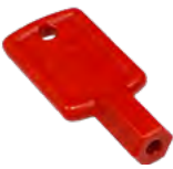
10006R Red Hex Key