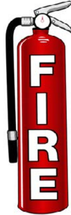
CL-401 Decal available with red or white background