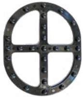
Fire Extinguisher Tray Accessory