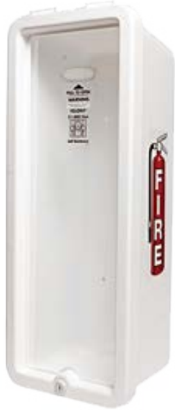
Island Chief 105-5 WWC-P

Cato's affordable fire extinguisher series, manufactured in the U.S, provides a dent and rust proof alternative to metal. Cato's Island Chief series fire extinguisher cabinets feature a security hexagonal lock and key to open and remove the trim and pull panel cover. The acrylic features a hand opening to easily pull panel out to gain access in case of fire.