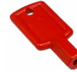
10006R Red Hex Key