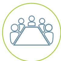
Conference Rooms and Classrooms