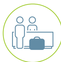
Atriums and Lobbies