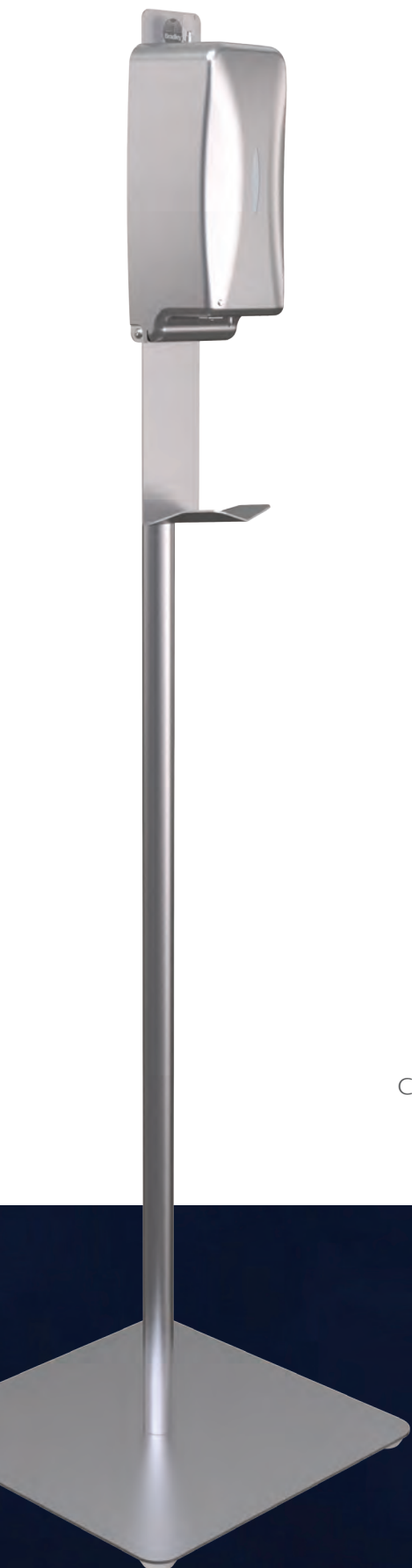
6A20-11 Hand Sanitizer Dispenser Stand