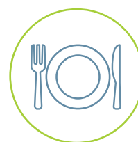
Cafeterias and Food Courts