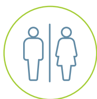
Outside of Restrooms