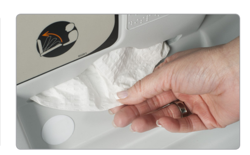
Convenient built-in liner dispenser.