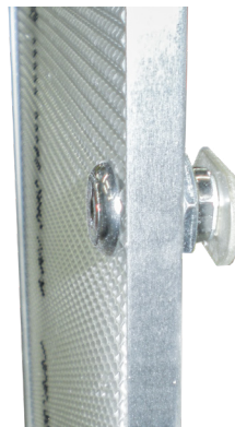
Flexible Cam Key Lock