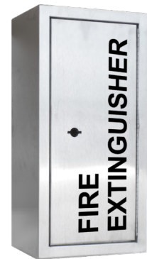
Cabinet with Detention Lock for I-3 Facility