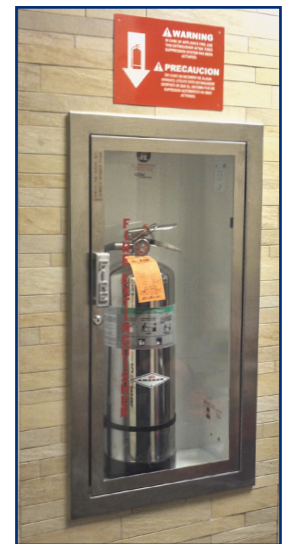
Class K Signage