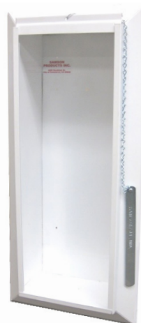
Break Glass Cabinet