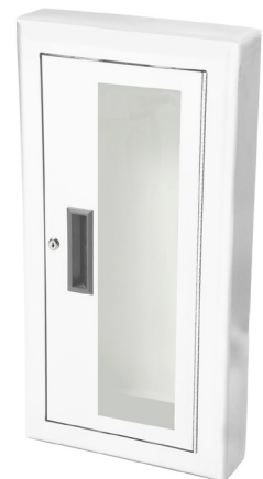
Lock and Recessed Handle Cabinet