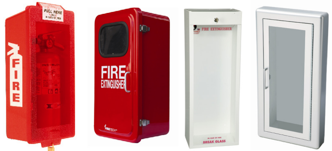
Exterior Examples Left to Right: ABS, Fiberglass, White Powdercoated Galvanized Steel, and Aluminum