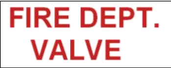
LDCHRFDV-R 10-1/4" x 4-3/8"