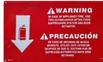
S26 - Decal 11-7/8" x 7-6/8"