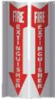
23S 4" x 18"