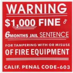
DRWF 4" x 4"