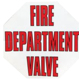
FDVO 6" x 6"