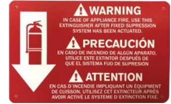
Saturn Sign 10-7/8" x 6-15/16"