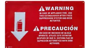
Saturn Sign-Red 11-7/8" x 7-6/8"