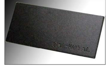
L2 / 695 LUMA COLOR, DARK BRONZE (DURO)