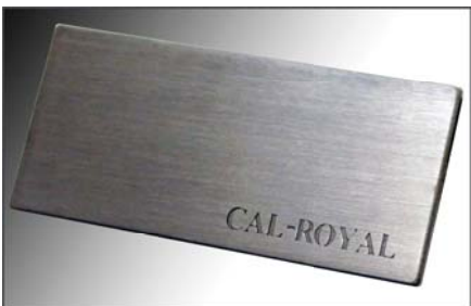
US17A / 621-648 SATIN BLACK NICKEL