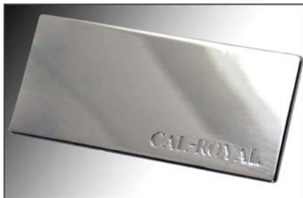
US26 / 625-651 POLISHED CHROME