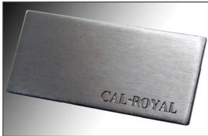
US15 / 619-646 SATIN NICKEL