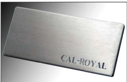
US32D / 630 SATIN BLACK NICKEL