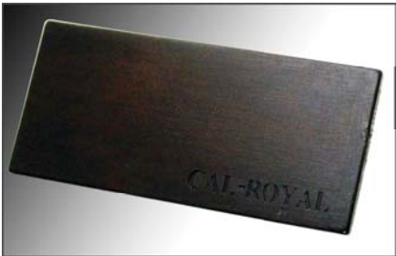
US14B BRIGHT BLACK NICKEL