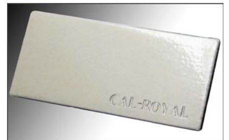
ELECTRO STATIC POWDER COATED WHITE