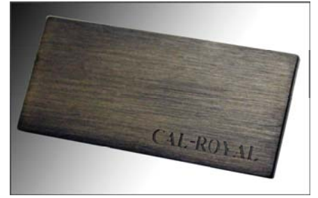
US5 / 609-638 SATIN BRASS OXIDIZED