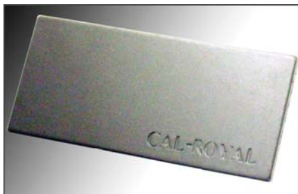
USP / 600 PRIME COAT