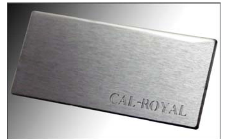
US26D / 626-652 SATIN CHROME