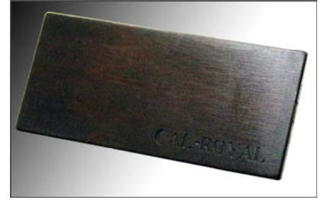
US10B / 613-640 ANTIQUÉ BRONZE OILED (OIL RUBBED BRONZE)