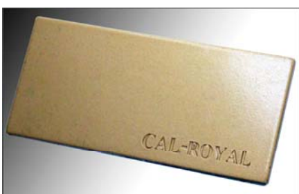
L3 / 694 LUMA COLOR, MEDIUM BRONZE