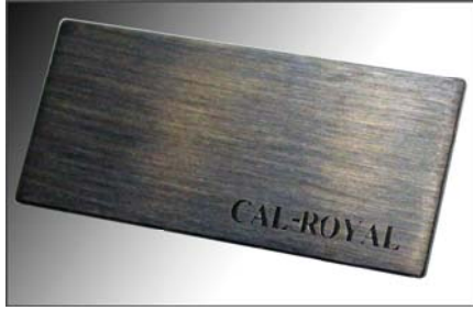
US10A / 614-641 ANTIQUÉ BRONZE LACQUERED