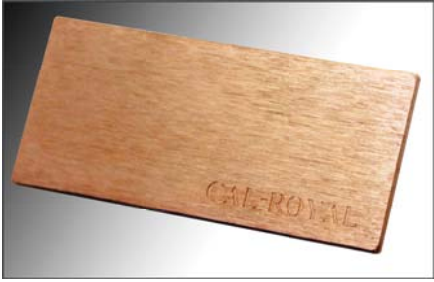
US10 / 612-639 SATIN BRONZE