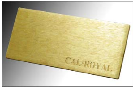
US4 / 606-633 SATIN BRASS