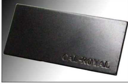
L1 / 693 LUMA COLOR, BLACK