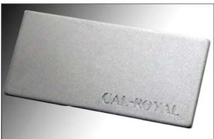
US28 / LS-689 LUMA SHEEN