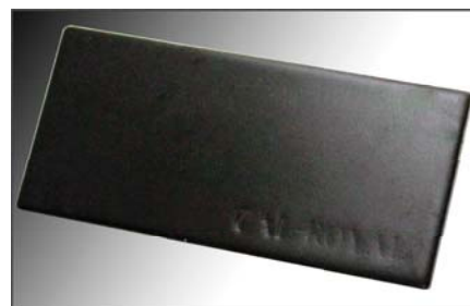
ELECTRO STATIC POWER COATED DARK BRONZE

Distributed by www.Ameraproducts.com Phone: (800) 608-6568 Fax: (409) 840-5545 info@ameraproducts.com