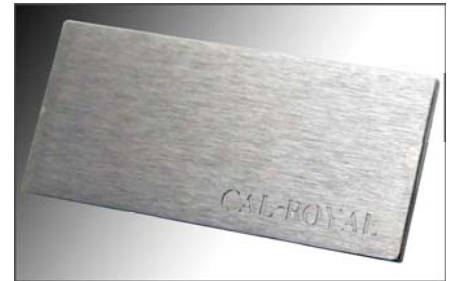
US15A / 620-647 SATIN NICKEL OXIDIZED