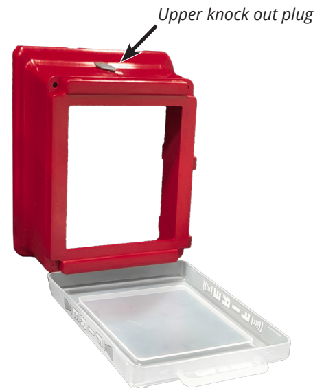
Figure 2: Pull Down Cover